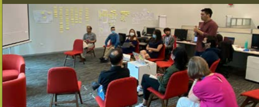
Participants engaging in a brainstorming session during the Venture Builder Programme.

This programme lets you experience the landscape, challenges and opportunities for agriculture and food security in Singapore and around the region. Learn about the science behind high-tech agriculture practices with practical experience in SUSS' own indoor farm, and complete a grow cycle of your own vegetables and uncover opportunities in the industry, from growing vegetables to the distribution of nutritional produce.