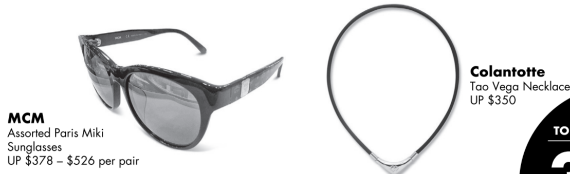
MCM Assorted Paris Miki Sunglasses UP $378 – $526 per pair