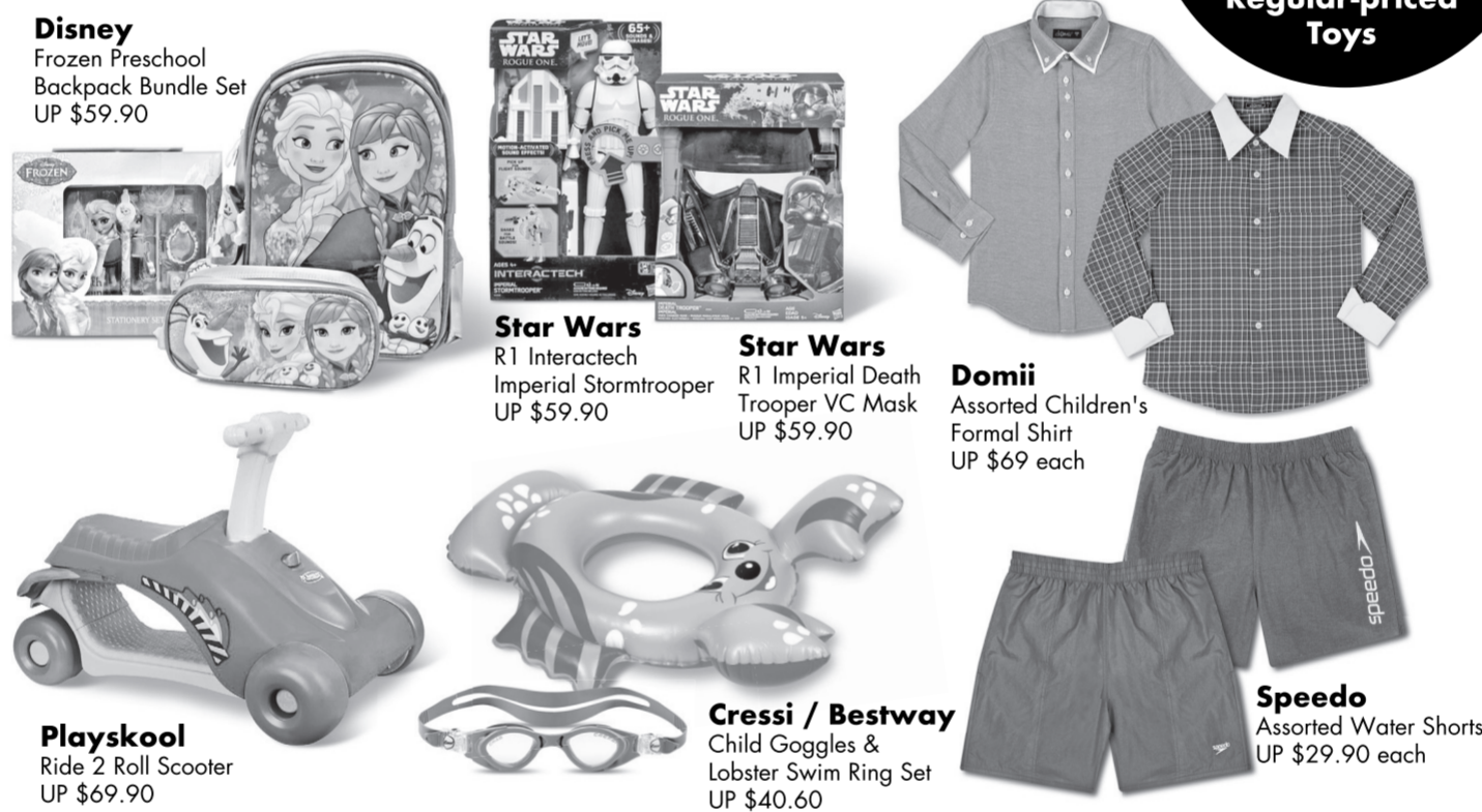
Disney Frozen Preschool Backpack Bundle Set UP $59.90