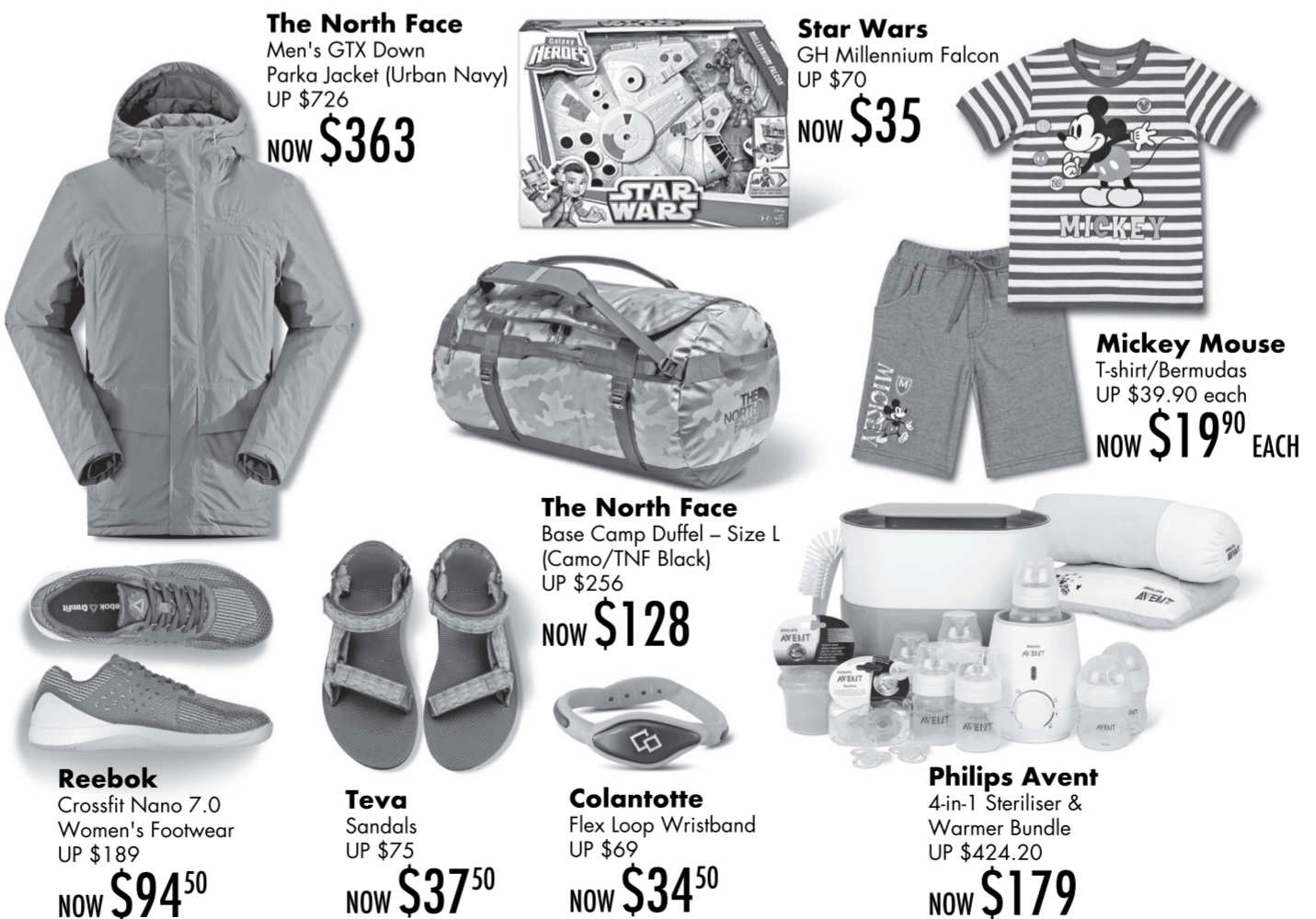
The North Face Men's GTX Down Parka Jacket (Urban Navy) UP $726 NOW $363