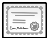
Certificates and Transcripts