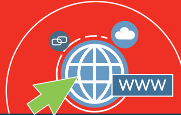
School of Science and Technology

From 1 April 2019, the Institute for Adult Learning (IAL) became an autonomous institute of SUSS. Both entities enable a synergistic collaboration as IAL brings to SUSS its expertise and experience in adult learning and Continuing Education and Training (CET), while SUSS provides an ecosystem of resources and experts rooted in academic rigour.