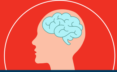
School of Humanities & Behavioural Sciences