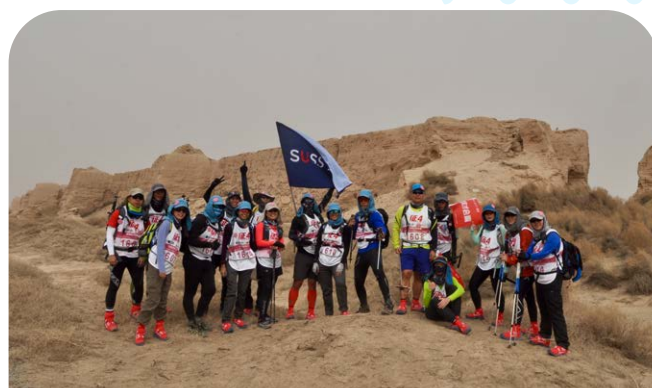
Student Life: Expedition – Gobi desert challenge