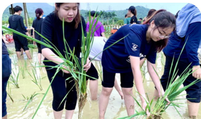
Student Life: At Dapeng Farm, students learn hands-on how some food are grown