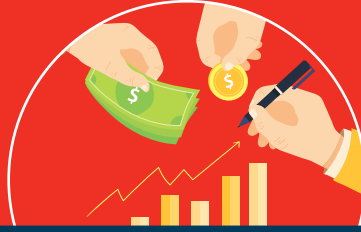
School of Business