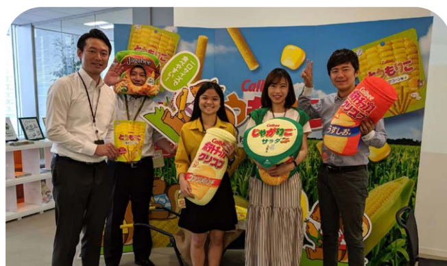
Career Development: Overseas Work Attachment (Japan, Calbee)