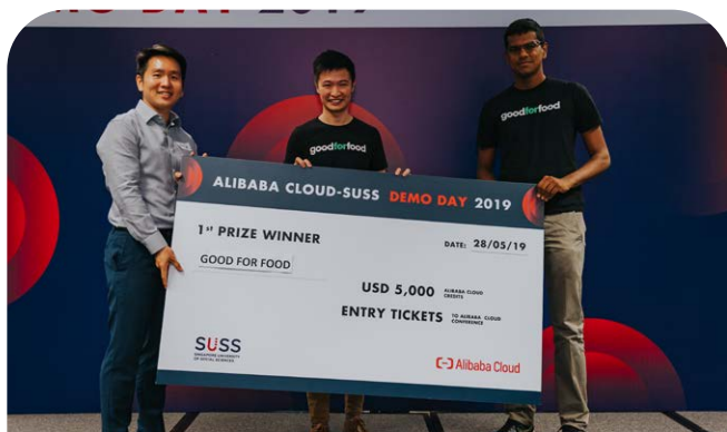
Entrepreneurship: Alibaba Demo Day 2019

Grounded in our core philosophy of 'Head, Heart, Habit' (3H), we continually develop well-rounded future talents who are professionally competent, socially conscious, and lifelong learners with a heart to impact lives. We build experiential and applied learning to enliven and enrich our student experience through a host of global learning programmes, internships, entrepreneurship and service learning projects as well as student-led expeditions to provide a holistic education that nurtures empathy, broadens contextual understanding and deepens perspectives.