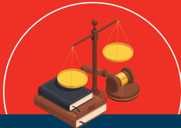
School of Law