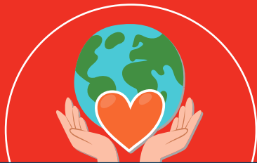
S R Nathan School of Human Development

Our programmes and courses are made available through our five schools: