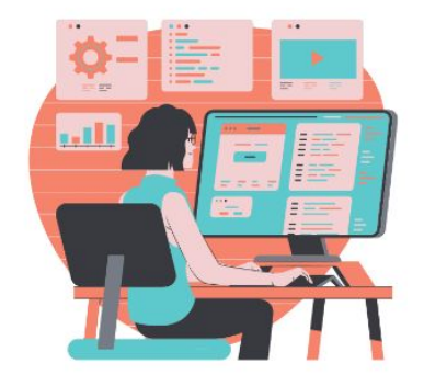
Effectively Manipulate & Analyse Data

Furthermore, embracing a data-driven approach provides a clear competitive advantage. Organisations that leverage data can anticipate market trends, identify emerging opportunities, and stay ahead of the competition. Consider Airbnb, the home-sharing platform, which utilises data analytics to understand pricing dynamics. By leveraging data, Airbnb ensures competitive rates for hosts and guests, securing its position as a market leader. To continually upgrade ourselves and remain competitive in the age of data, several strategies are worth considering.