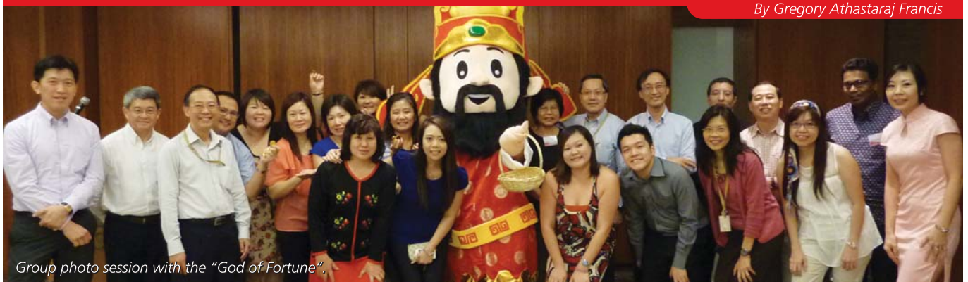
Group photo session with the "God of Fortune".

The annual New Year Dinner hosted by UniSIM for its alumni volunteers was a warm and casual event held on Feb 22 at the Clementi Campus. As it coincided with Lunar New Year, the dinner started with the tossing of "Yu Sheng". Called "Lo Hei", this term is derived from the Cantonese dialect where "Lo" means "to toss" while "Hei" means "to rise", a traditional reference towards a thriving business especially meaningful for businessmen during the New Year. For us, it was about warm wishes offered all around amidst laughter and joyful fraternity.