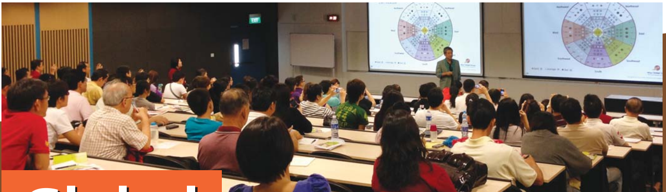
Grandmaster Tan presenting on the global outlook for 2013.