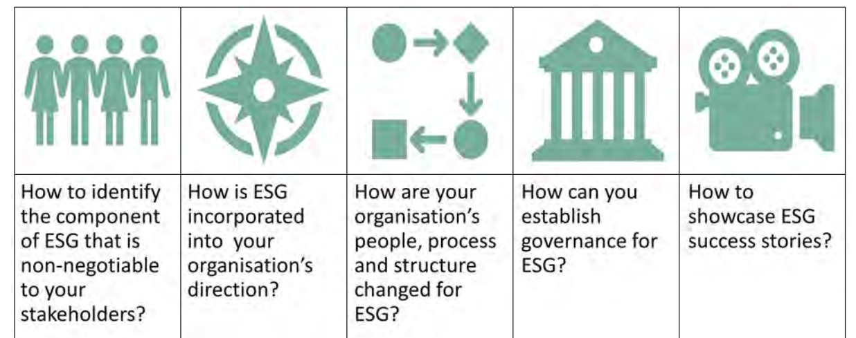
FIGURE 1 THE FIVE ESG QUESTIONS FOR CHARITIES

Now that the context for ESG for Charities is established, the next step is for charities to tackle the issue of “how” to do ESG. For charities which require guidance to begin their ESG journey, I have compiled a five-question framework for organisations to utilise (Figure 1).