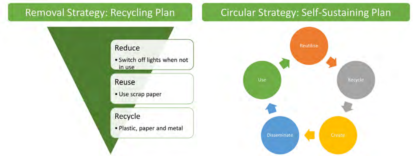
FIGURE 3 REMOVAL STRATEGY (LEFT) AND CIRCULAR STRATEGY (RIGHT)

With clear SOPs like those above, staff members and volunteers would know precisely how to do ESG, thus dispelling any hesitation they might have towards ESG. The SOPs also help in ensuring that ESG practices can be carried out even without stringent monitoring.