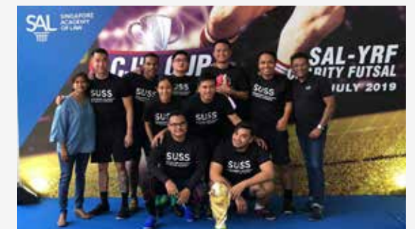
SAL-YRF CHARITY FUTSAL – THE CJ'S CUP