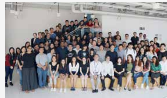
SLAW STUDENT ORIENTATION